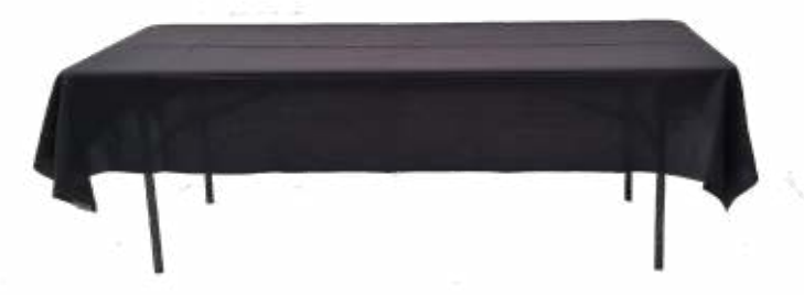
Trestle Tables 1.2m, 1.8m, 2.4m