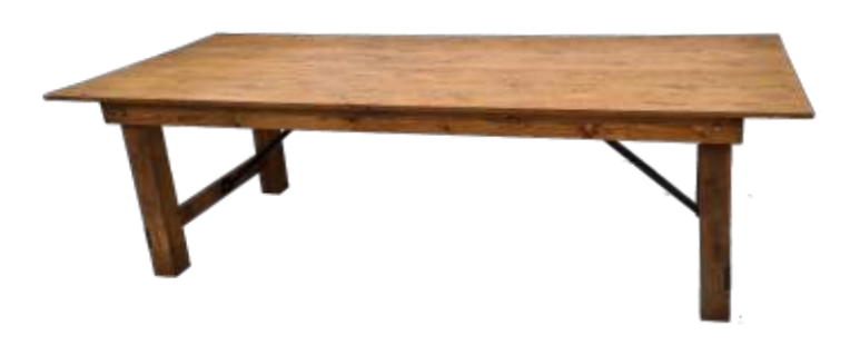
2.4m Wooden Table