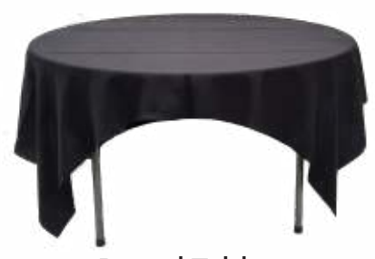
Round Tables 80cm 1.2m, 1.5m 1.8m